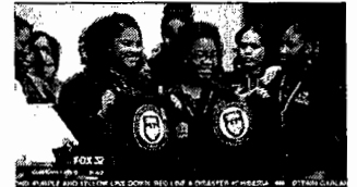
UChicago Charter Twins Receive Full-Ride Scholarships to University of Chicago